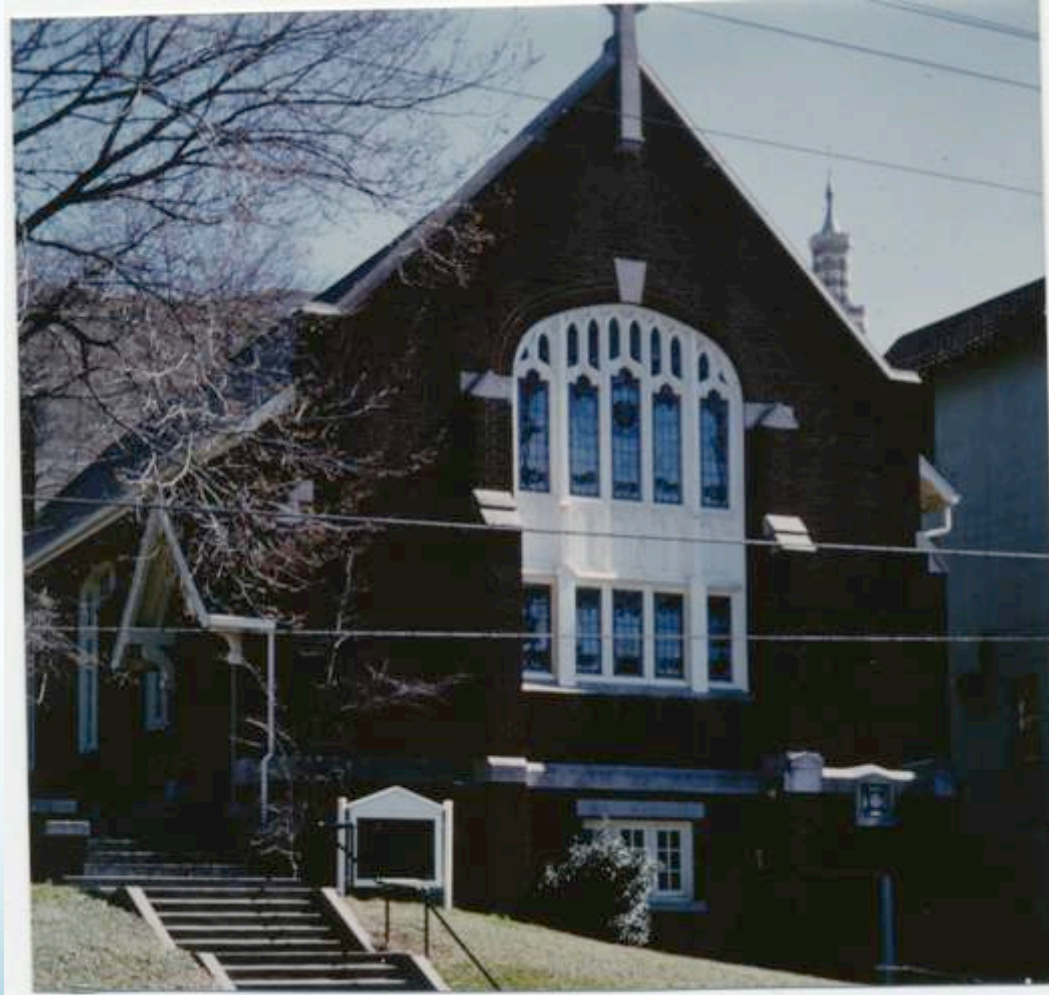
3 rd Unitarian Church Building