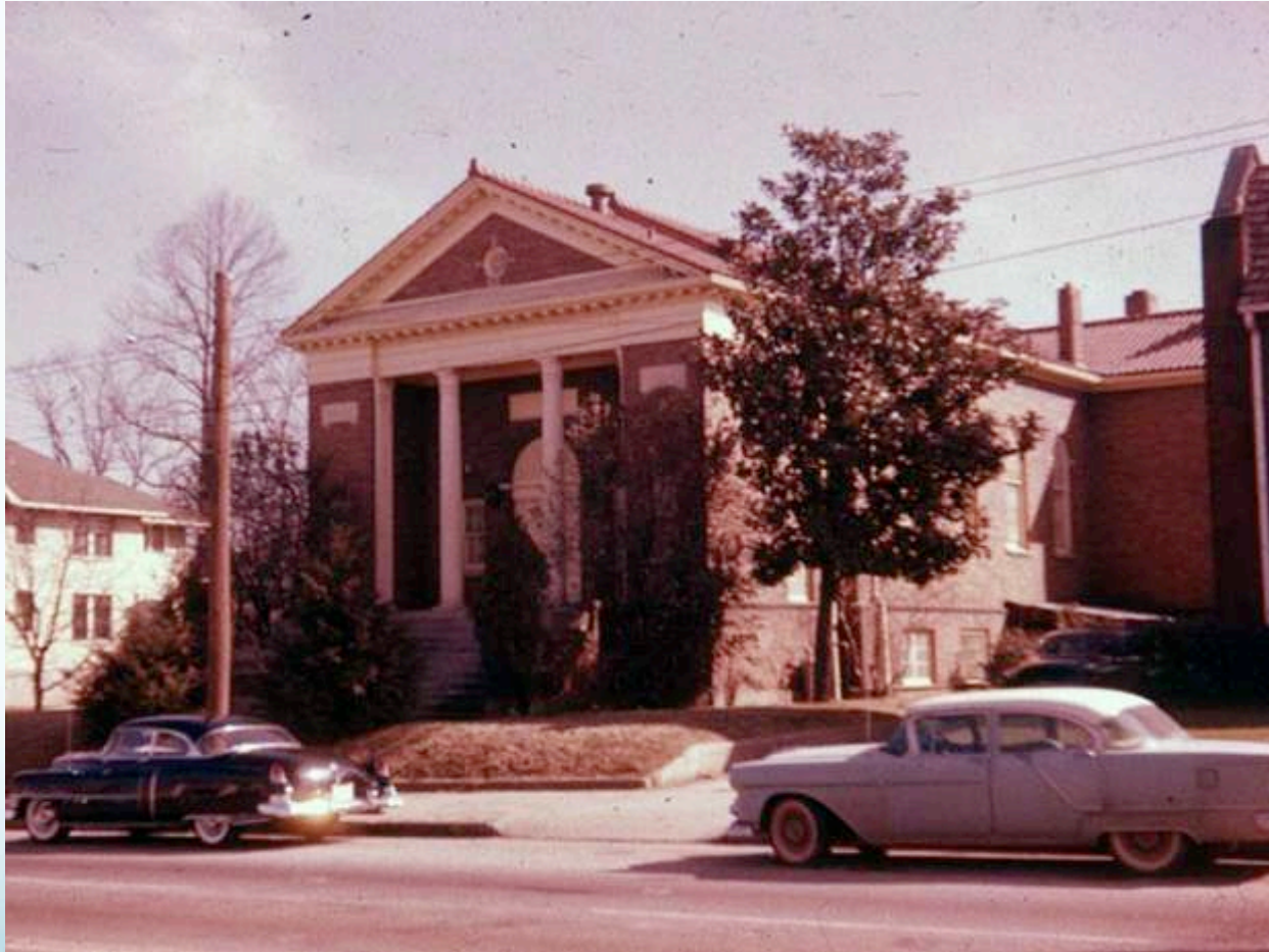
4 th Unitarian Universalist Church Building