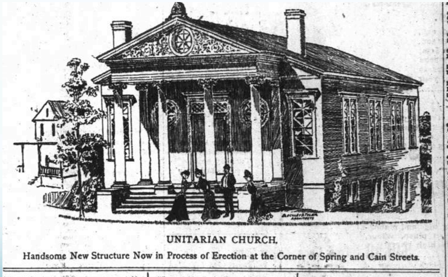
2 nd Unitarian Church Building