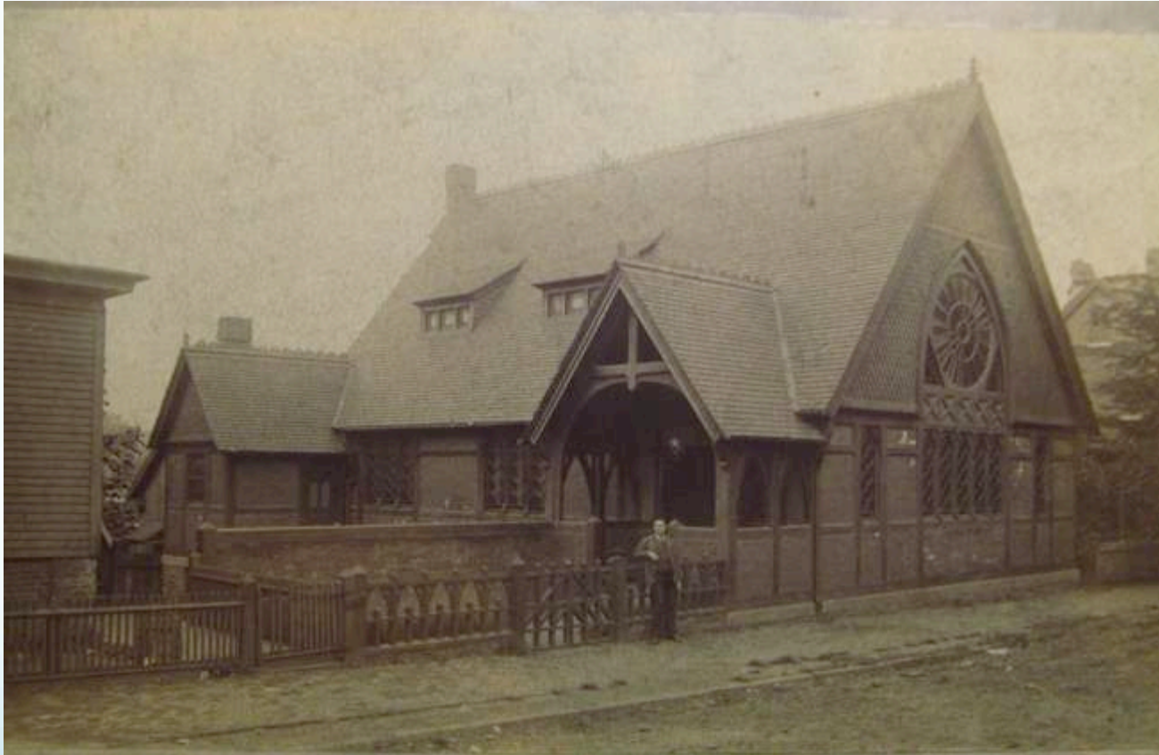
1 st Unitarian Church Building